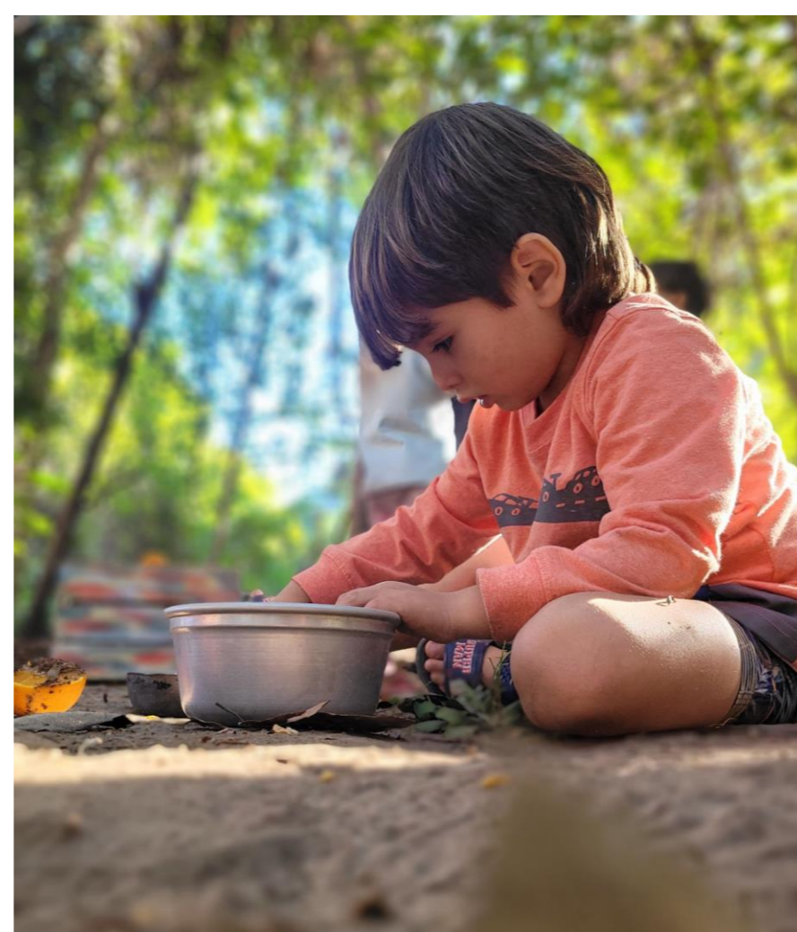
Guto Moreira - @cipo_trails