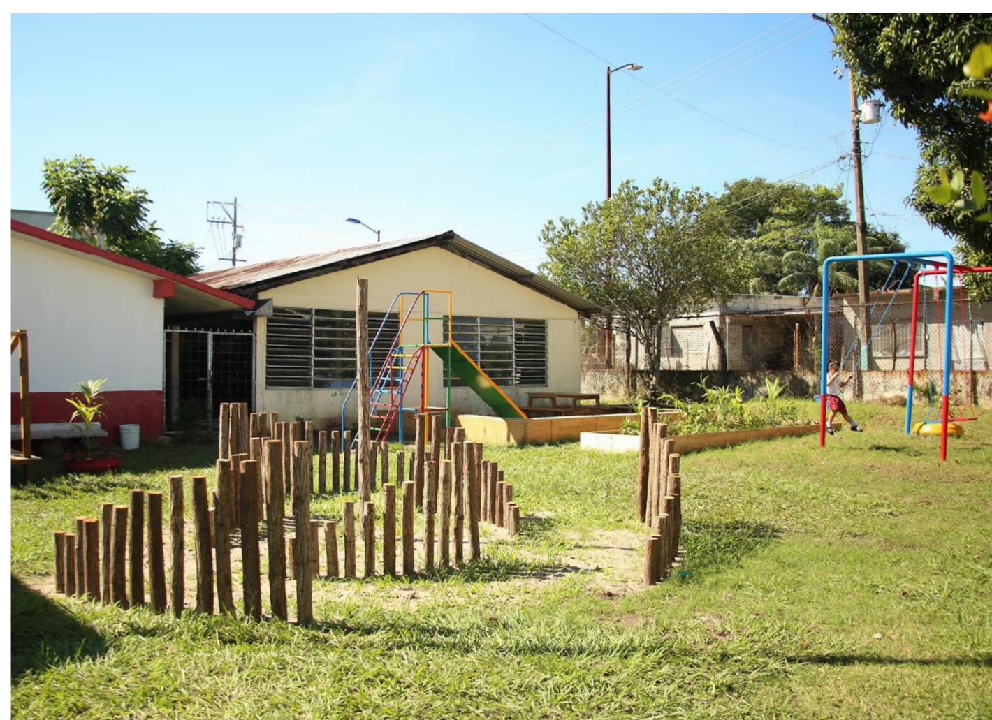
LAPIS La Florecita