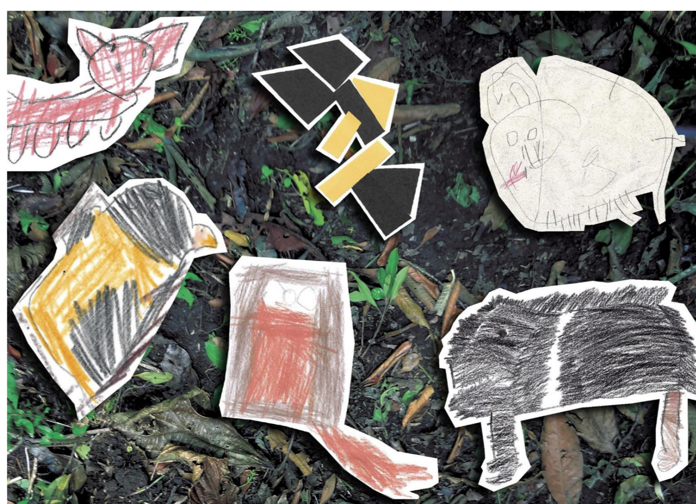
Children's art work