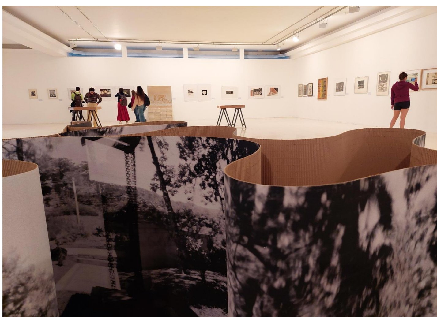
MACC exhibition.