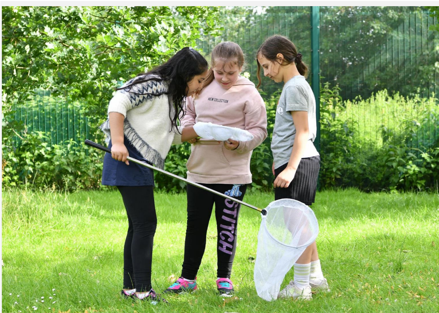
Learning through Landscapes