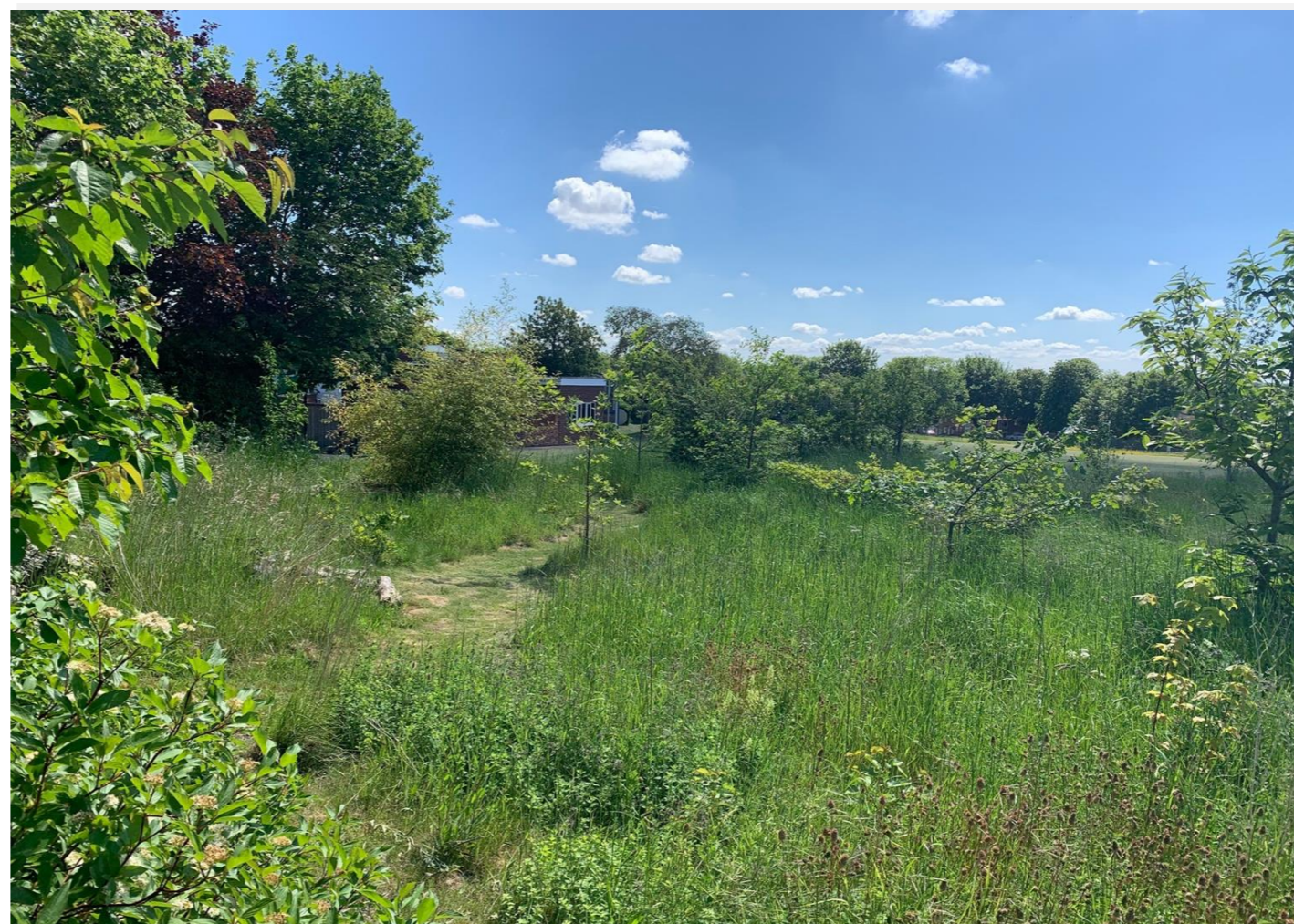
Learning through Landscapes