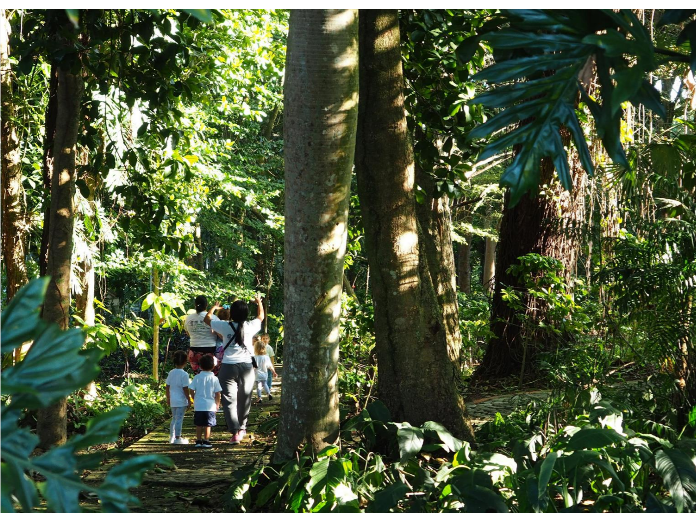
Raquel Garrido 2019

http://primipassi.edu.do • info@primipassi.edu.do