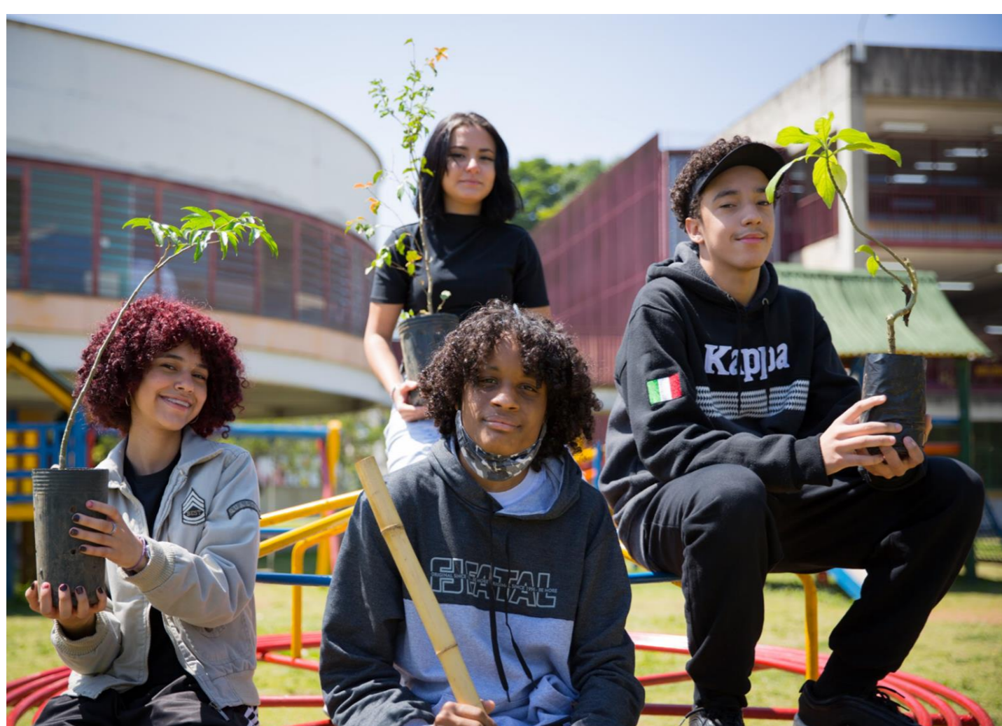
Minifloresta CEU Campo Limpo 2021 Imagem formigas-de-embaúba (Carol Caffé)

gabriela.ribeiro@formigas-de-embauba.org.br