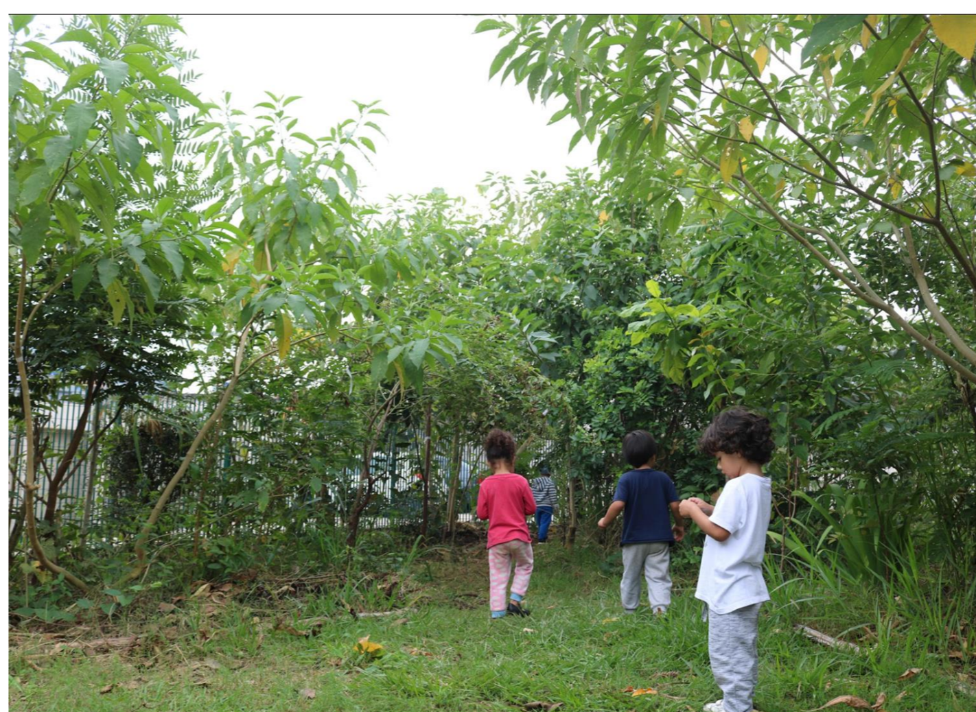
Minifloresta CEU Campo Limpo 2023 Imagem formigas-de-embaúba (Maggiory Simões)