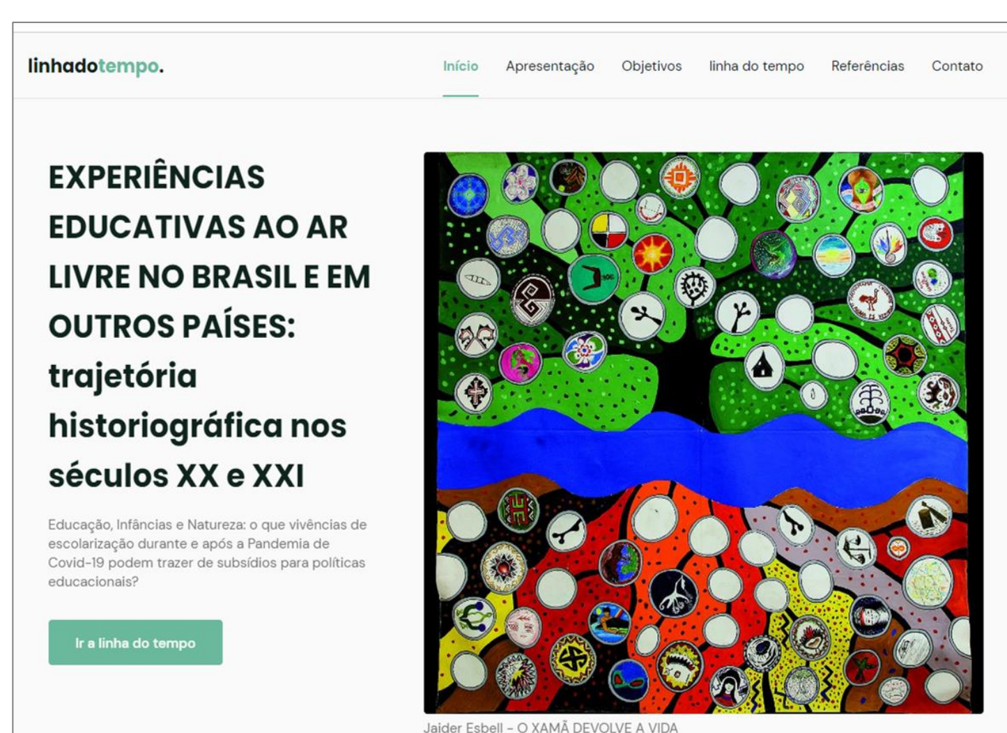
Timeline Experiências Educativas ao Ar Livre no Brasil e em Outros Países: trajetória historiográfica nos séculos XX e XXI