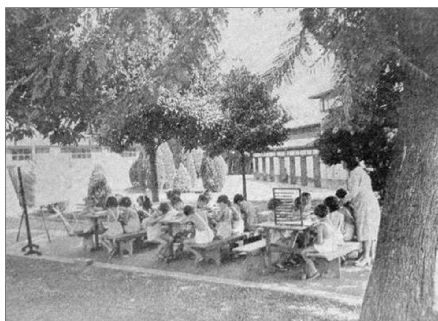
Revista Brasileira de Educação Física. v. 2, n. 13, p. 27, jan. 1945