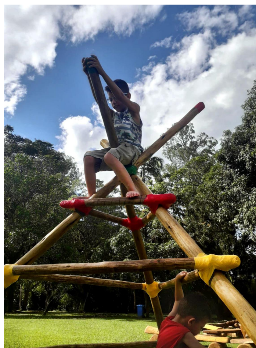
Coletivo Parque de Bambu