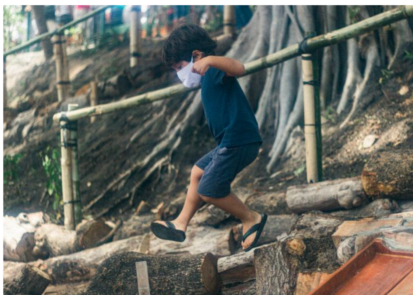
Fortaleza Municipal Government