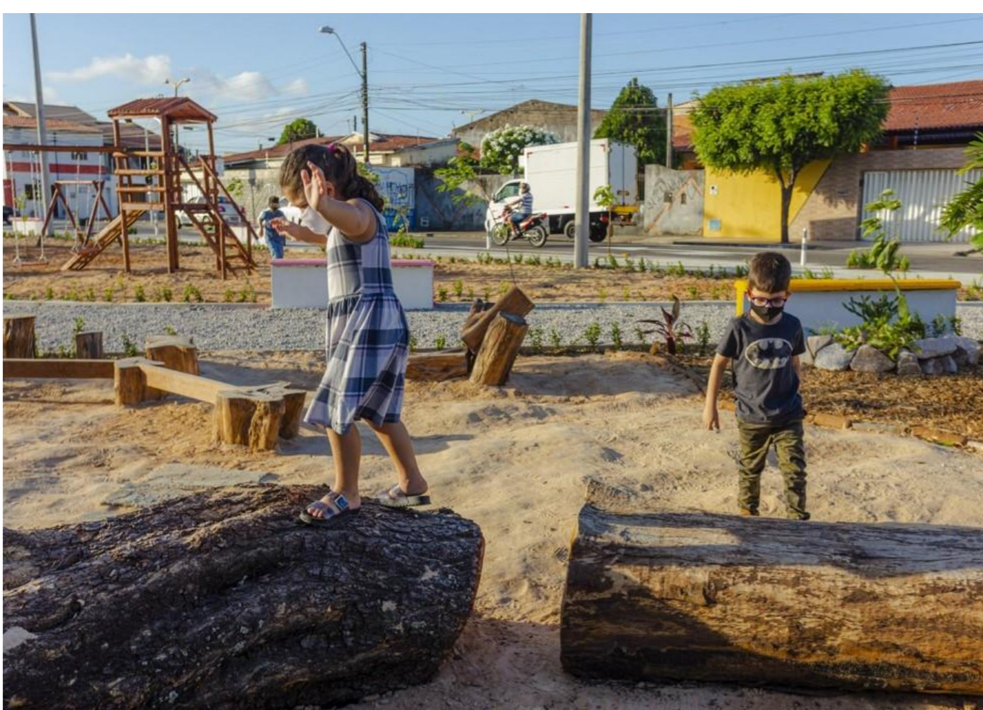
Fortaleza Municipal Government

angelica.leal@gabpref.fortaleza.ce.gov.br; luciana.lobo@seuma.fortaleza.ce.gov.br.